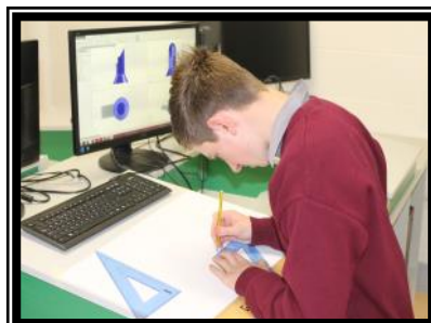
The DCG room