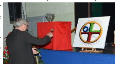
Blessing of new Logo