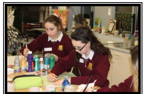
The Art Room