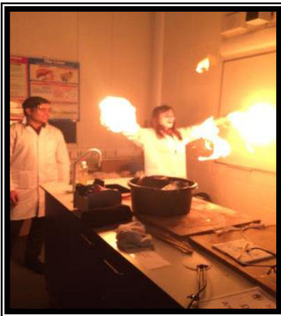
Science - setting the night on fire.