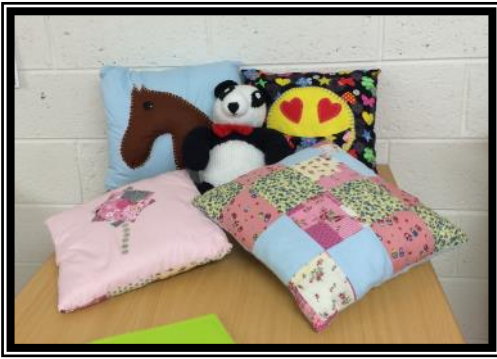
Junior Cert Craft and Design Projects