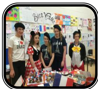
French Department—On Open Night

The movie follows the ascent of a Parisian teenager with Tunisian origins fighting for the Arab Spring to catch the attention of his beautiful class-mate Sygrid. It was a very enjoyable time for all!