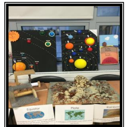
First Year Geography Projects