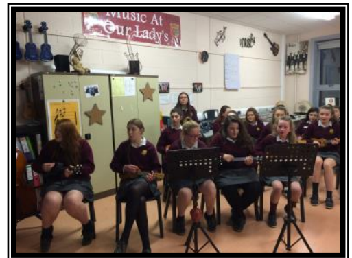
The Music Department