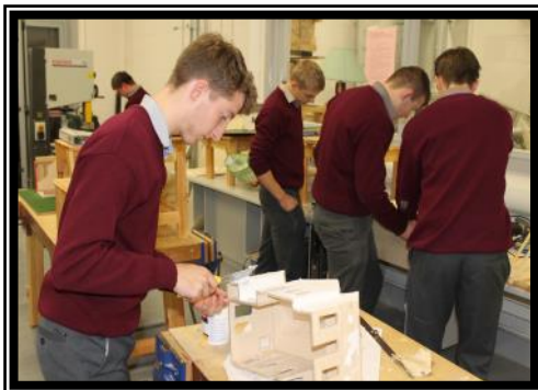
The Woodwork Department