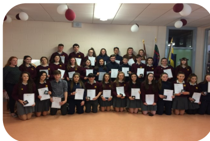
Gaisce award recipients of 2016-2017