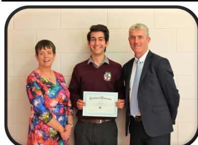
International Award Vittorio Guerrieri