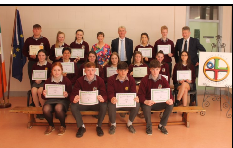
5th year Subject Award recipients