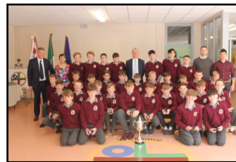
Corn Uí Chatháin Team