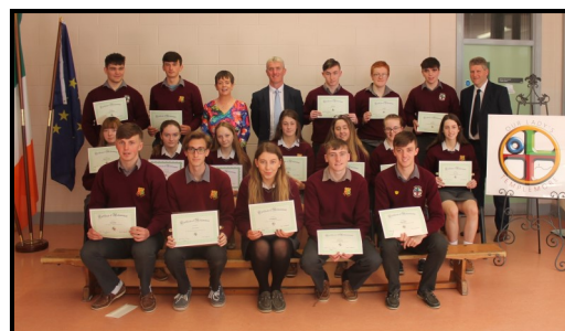
6th year Subject Award Recipients