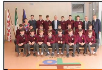
Fitzgerald Cup Team