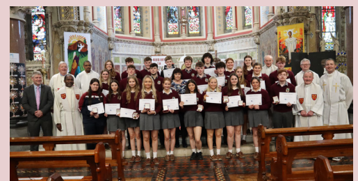
John Paul II Ceremony

hardworking, lighthearted and committed. Above all they worked as a team of friends hailing the John Paul 2 "Spirit of Generosity" at all times. We are so proud of this group of young people. They have carried out a multiplicity of tasks both in school and in the parish including some of the following: - Bogathon Fundraiser in aid of IMNDA.