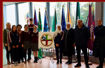
Student Council fundraiser for victims of earthquake in Turkey and Syria.

We also petitioned for new school jackets, where we allowed students to vote on the brand and style they liked the most. We are delighted that the online store is now live and