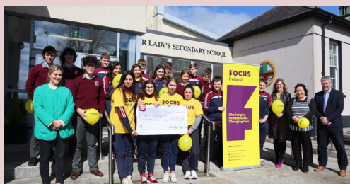
John Paul II students completed a fundraiser for Focus Ireland

The John Paul II students have shown huge commitment to the programme over the past year, it is a faith achievement award for young people between the ages of 16-18. The school management provided great support at all times, helping it to be a great success. The students have been