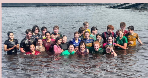
John Paul II students completed a Bogathon to raise funds for Motor Neurone Disease

The John Paul II students have shown huge commitment to the programme over the past year, it is a faith achievement award for young people between the ages of 16-18. The school management provided great support at all times, helping it to be a great success. The students have been