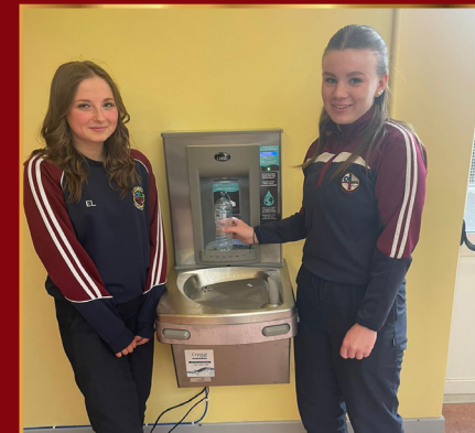
Student Council organised the installation of a new water fountain.