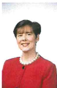
Norma Foley TD Minister for Education

My Department has published an information leaflet for parents/guardians on how the new scheme will operate. The scheme guidance and parents' leaflet is published at www.gov.ie/schoolbooksschemes Should you have any query in relation to this new scheme please email: jcschoolbooks@education.gov.ie