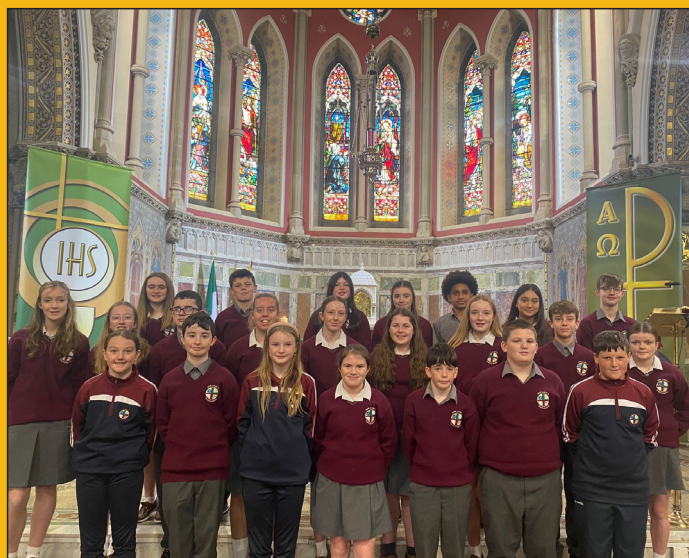
First year Opening School Mass