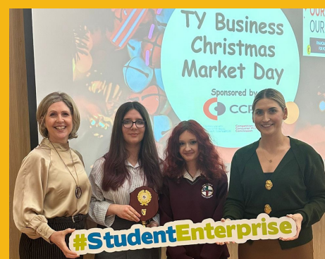
Overall Best Company: Solar Design and Bralliance (Joint Winners)